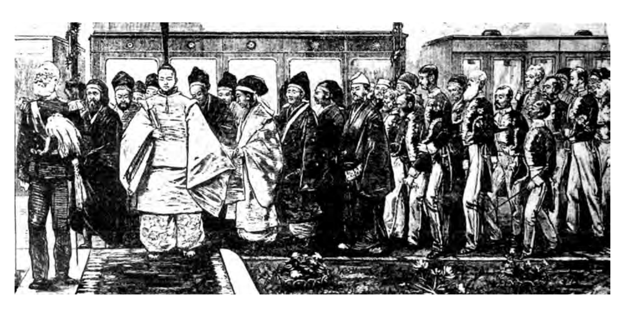
The Emperor opening Japan's first railway in 1872.

3 Study the picture, and then answer the questions which follow.